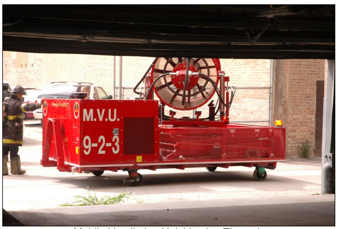
Mobile Ventilation Unit Venting Through Groud Level Garage Entrance