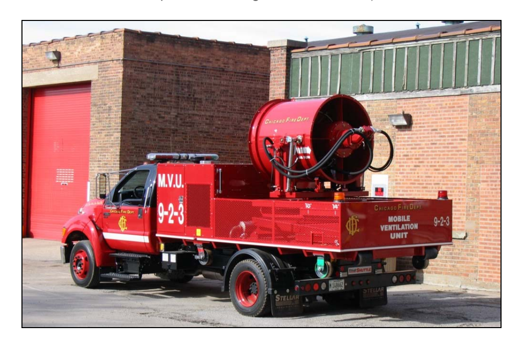
Chicago FD MVU-48 on Ford F-650 Chassis