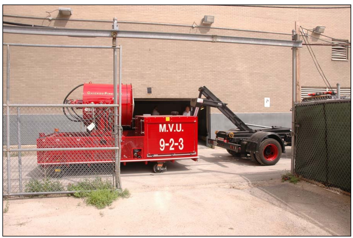
Mobile Ventilation Unit being Off-loaded