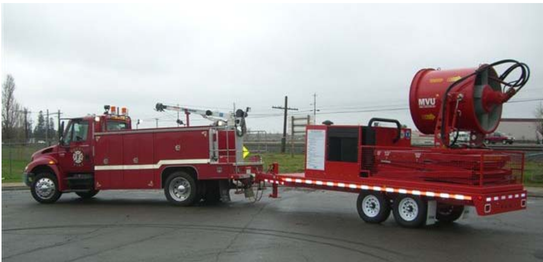
Fresno F.D. 48" Trailer Mounted MVU™