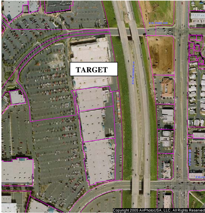
TARGET STORE 7600 N. Blackstone