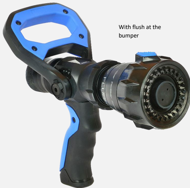
With flush at the bumper