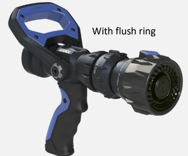
With flush ring